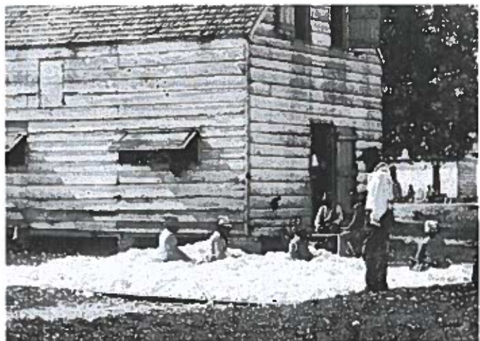
Slaves in South Carolina prepare cotton for the gin in 1862.

One hundred years later, the idea of slaves and poor whites joining forces would shock the senses, but in the early days of the English colonies, the two groups had