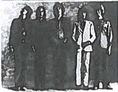
The Rolling Stones

A Stones tour is rarely complete without a black performer, be it Stevie Wonder or Ike and Tina Turner; the black performer gets nationwide fame and fortune; the Stones get a crack at authenticity. Mick Jagger stood in the wings every night to watch Tina and the Ikettes slide, turn, and kick with impeccable abandon; at the time he was content to move about the stage hitting a tambourine until it broke and then hitting another. By the tour's end, much to Tina's surprise, he had managed to devise a unique if labored form of rhythmic dancing, though it is said he repaid their beneficence by having the microphones turned off if they performed too well. B.B. King, Muddy Waters, and most of the long standing bluespeople were brought to theaters, clubs, and large audiences by bands of their young, white, and much more successful imitators. Brenda Holloway of "Every Little Bit Hurts" sings trifling backups for Joe Cocker; Merry Clayton was "discovered" backing the Stones; Billy Preston was brought forth from the wilderness by George Harrison.