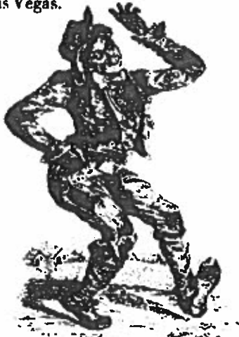
Thomas "Daddy" Rice

E LVIS PRESLEY was the greatest minstrel America ever spawned, and he appeared in bold whiteface. He sang like a nigger, danced like a nigger, walked like a nigger, and talked like a nigger. Chuck Berry, unfortunately, was a nigger. They are two of the more splendid beings in the Great Chain of Minstrelsy that stretches from the start of the nineteenth century to the present, encompassing circuses, medicine shows, Broadway, the Fillmore East, nightclubs, concert halls, television, and Las Vegas.